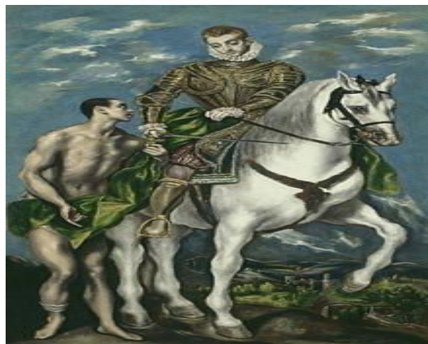
St. Martin of Tours, November 11

Pastor's Pun: What do you get from a pampered cow? Spoiled milk.