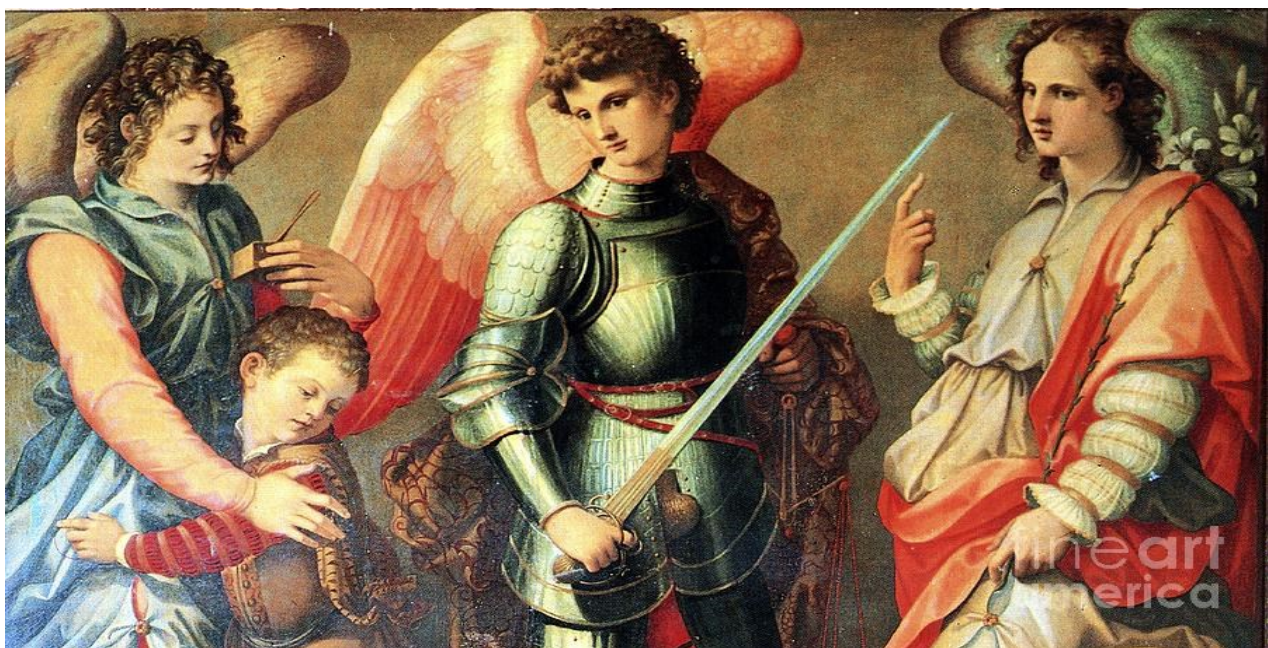
St. Michael, Gabriel and Raphael, Archangels, September 29

Pastor's Pun: Why did the fox chase the rabbit? It fancied fast food