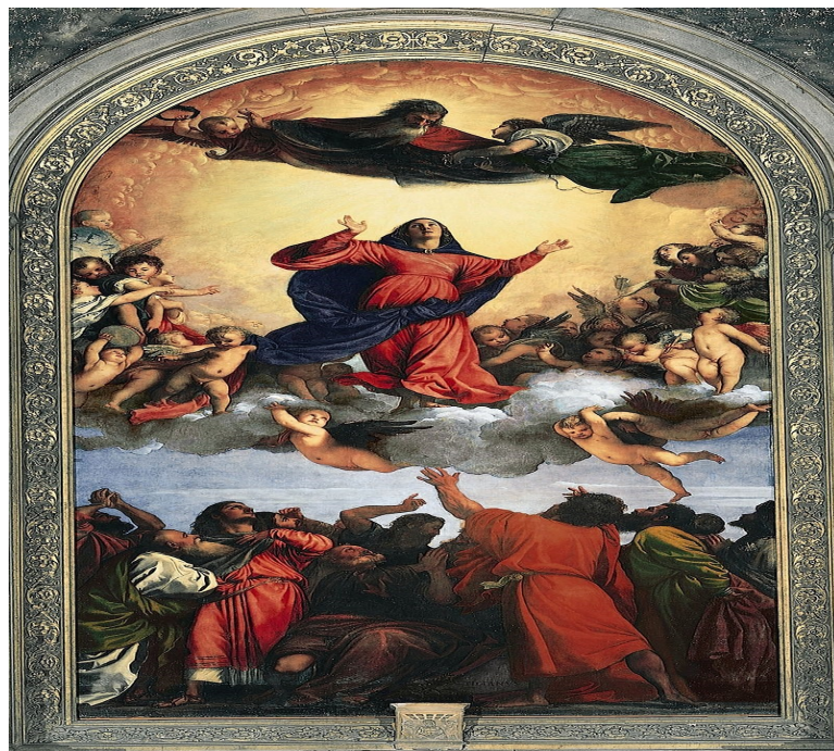
The Assumption of the Blessed Virgin Mary

Pastor's Pun: What does an alligator cook in? A crock-pot